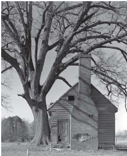
Cover: slave house at Cibula Farm, Prince George County.